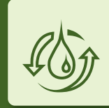
Water Treatment Plants (WTP)