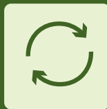
Reverse Osmosis (RO) systems