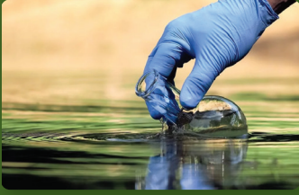
Advanced testing and analysis of water, wastewater, soil, and sludge