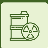
Hazardous waste characterization and disposal solutions