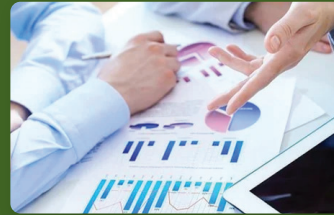
Post-monitoring environmental status reporting