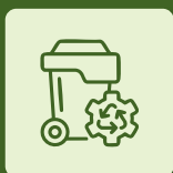
Development of solid waste management plans (storage, treatment, and disposal)