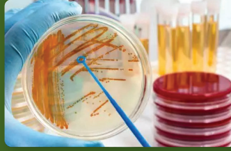
Microbial, heavy metal, and bioassay analysis with treatability studies