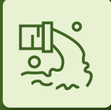
Effluent Treatment Plants (ETP)

Offer Engineering, Procurement, and Construction (EPC) and Annual Maintenance Contracts (AMC) for: