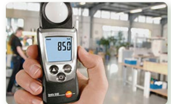
Continuous and periodic light assessment