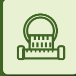
Sewage Treatment Plants (STP)