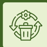
Coordination with regulatory bodies for waste management approvals