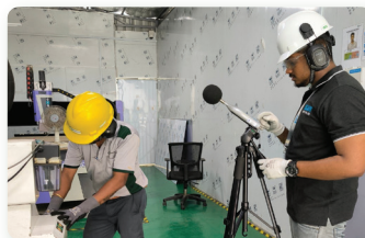
Workplace noise assessment