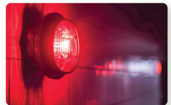
Task-specific and emergency lighting evaluations