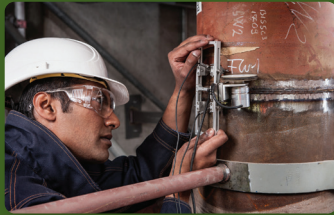
Pressure vessel inspection and testing