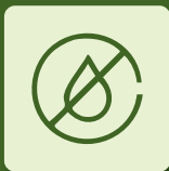
Zero Liquid Discharge (ZLD) systems