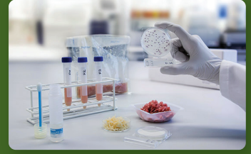
Food testing and analysis