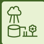
Rainwater harvesting studies, installation, and water distribution system design