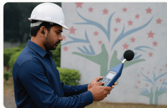
Ambient noise assessment